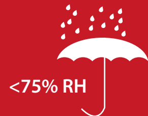
Humidity of storage conditions