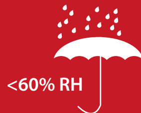
Humidity of storage conditions